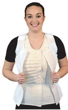
Vest with JoViJacket