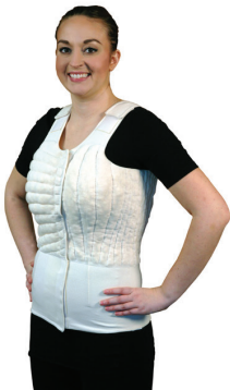
Vest with optional Full Padding (shown with vertical & horizontal padding options for illustration)